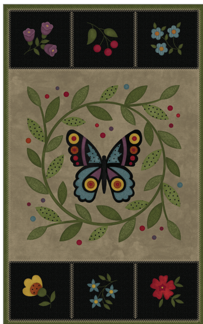
Fabric 4 - 1 panel MASF9940-Z