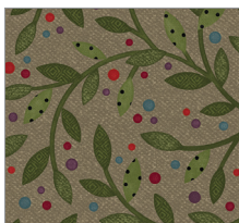
Vine on Khaki- MASF9944-T